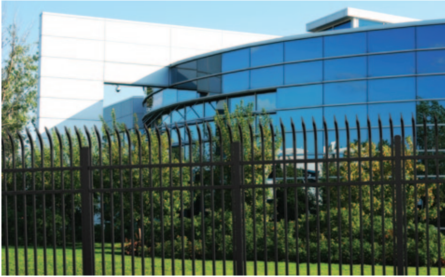
1-5/8" x 1-5/8" Reinforced Rail 1" Pickets

Incorporates our largest-scale components for industrial strength and safety.